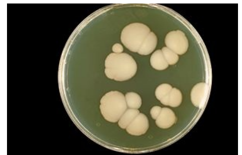
Candida albicans on Sabouraud agar.