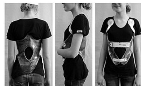
Corset to correct kyphosis.