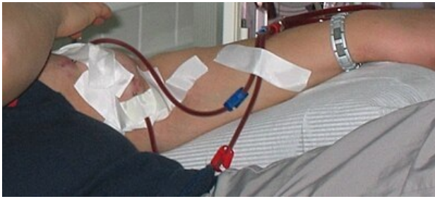
AV shunt cannulated with dialysis needles attached to a dialysis machine