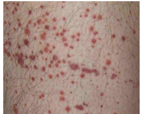
Purpura – petechie

Autoantibodies are formed in the body (B-lymphocytes with the help of CD4+ T-lymphocytes) against platelet surface antigens, mostly against glycoprotein IIb-IIIa. The trigger is often an infection (upper respiratory tract infection, more rarely varicella, mumps, rubella, EBV infection, vaccination with a live vaccine). Platelets with bound antibodies are absorbed by macrophages and then disappear mainly in the spleen. Autoantibodies inhibit megakaryopoiesis, which results in reduced platelet production by bone marrow megakaryocytes, thrombopoietin levels are normal. [2]