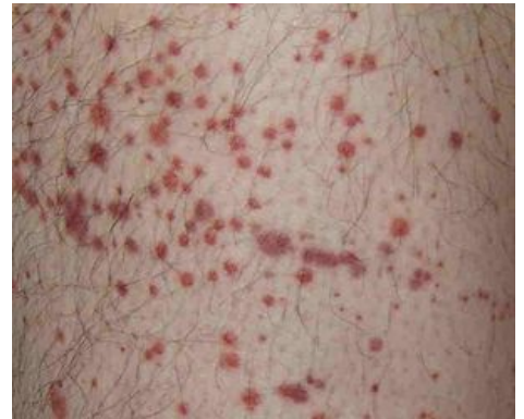
Image of purpura