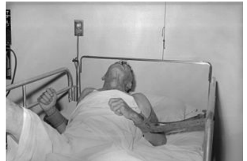
Patient with rabies

Viremia does not develop in rabies, and the virus, which spreads through the axoplasm of neurons, is protected for a long time from contact with cells of the immune system. In unvaccinated individuals, specific serum antibodies usually appear at the same time as the overt disease. An important sign of CNS infection is the finding of specific Ig in the cerebrospinal fluid.