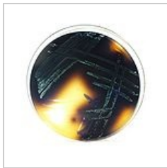
Enterococcus faecalis, Bile esculin agar (BEA)