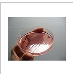
Shigella flexneri , thiosulfate-citrate- bile salts-sucrose agar (TCBS)