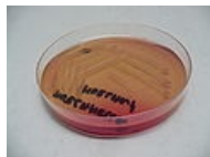
Morganella morganii, Endo agar