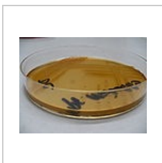
Proteus mirabilis , thiosulfate-citrate- bile salts-sucrose agar (TCBS)