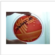
Streptococcus agalactiae, blood agar, \beta -hemolysis detail