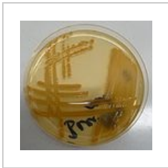
Bacillus subtilis , Mueller-Hinton agar