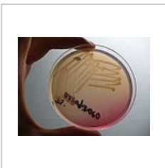
Pseudomonas aeruginosa , Endo agar