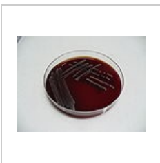
Citrobacter freundii , blood agar