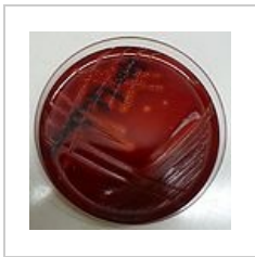
Streptococcus pyogenes, blood agar