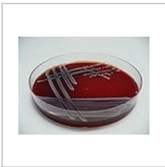
Staphylococcus epidermidis, blood agar