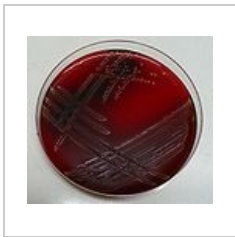
Streptococcus agalactiae, blood agar