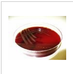
Streptococcus pneumoniae, blood agar, R-phase