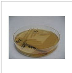
Pseudomonas fluorescens , Mueller-Hinton agar, smell with scent of jasmine