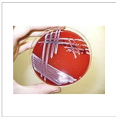
Staphylococcus epidermidis, detail: no hemolysis