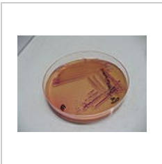
Pseudomonas fluorescens , Endo agar, smell with scent of jasmine