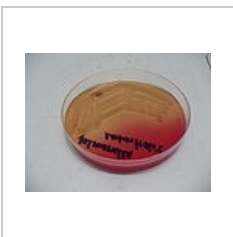
Salmonella enterica enteritidis , Endo agar