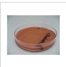
Proteus mirabilis , Endo agar, plazivý růst