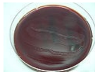
Proteus vulgaris, blood agar