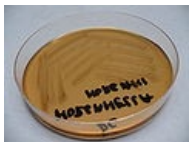
Morganella morganii, thiosulfate-citrate- bile salts-sucrose agar (TCBS)