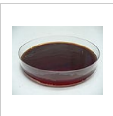
Proteus mirabilis , blood agar