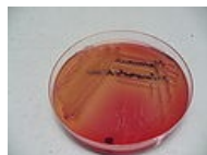
Yersinia enterocolitica, Endo agar