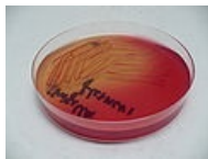
Shigella flexneri, Endo agar