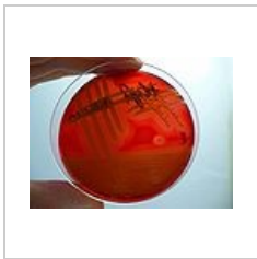
Staphylococcus aureus, blood agar, \beta -hemolysis detail