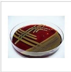
Staphylococcus aureus, blood agar