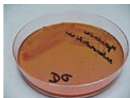
Yersinia enterocolitica, thiosulfate-citrate- bile salts-sucrose agar (TCBS)