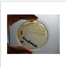
Pseudomonas aeruginosa , Mueller-Hinton agar