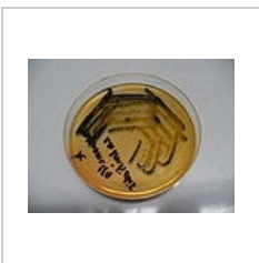
Salmonella enterica enteritidis , thiosulfate-citrate- bile salts-sucrose agar (TCBS)