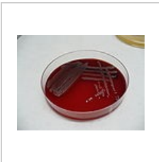
Pseudomonas fluorescens , blood agar, smell with scent of jasmine