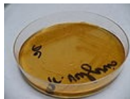
Proteus vulgaris,thiosulfate -citrate-bile salts- sucrose agar (TCBS)