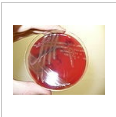
Streptococcus pneumoniae, R-phase, \beta -hemolysis detail