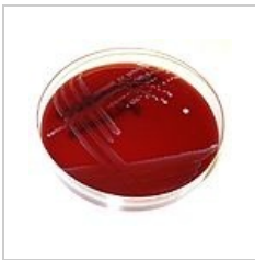
Enterococcus faecalis, blood agar