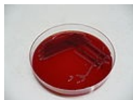
Yersinia enterocolitica, blood agar