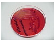
Klebsiella pneumoniae, Endo agar