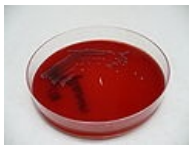
Shigella flexneri, blood agar