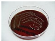
Morganella morganii, blood agar