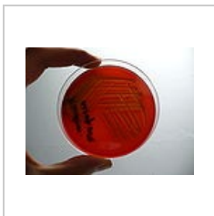
Pseudomonas aeruginosa , blood agar