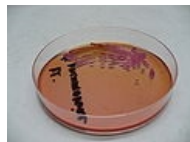
Klebsiella pneumoniae, thiosulfate-citrate- bile salts-sucrose agar (TCBS)