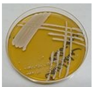
Candida albicans, Sabouraud agar