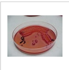
Escherichia coli , thiosulfate-citrate- bile salts-sucrose agar (TCBS)