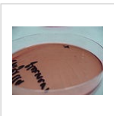
Shigella flexneri , thiosulfate-citrate- bile salts-sucrose agar (TCBS)