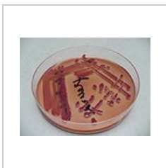
Citrobacter freundii , thiosulfate-citrate- bile salts-sucrose agar (TCBS)