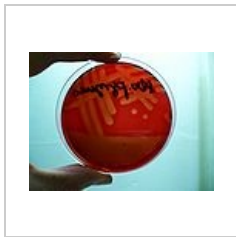
Streptococcus pyogenes, blood agar, \beta -hemolysis detail