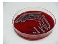
Klebsiella pneumoniae, blood agar