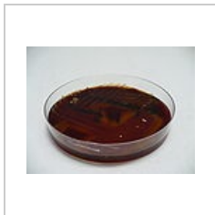
Streptococcus pneumoniae, blood agar, M-phase