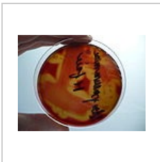
Streptococcus pneumoniae, M-phase, detail \beta -hemolysis