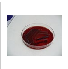
Salmonella enterica enteritidis , blood agar