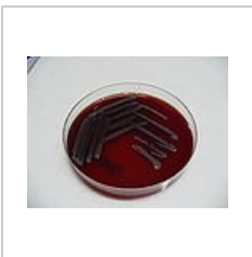
Escherichia coli , blood agar