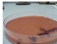
Proteus vulgaris, Endo agar