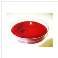
Neisseria pharyngis, blood agar