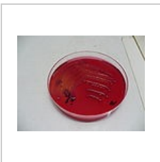
Escherichia coli , Endo agar