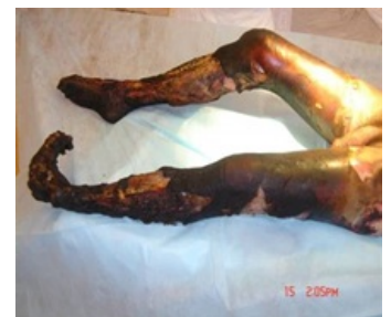
Deep burns of skin, muscle and bone tissue caused by high voltage.