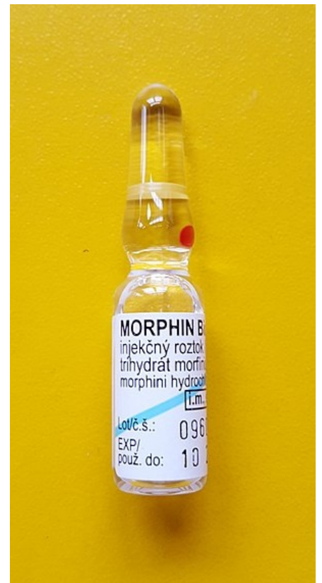
Morphine 1% vial