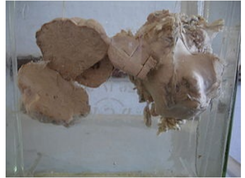
Krukenberg Tumor of Ovary

Epithelial tumors mainly spread implantationally and lymphogenously [2] . Dysgerminomas metastasize mainly ``lymphogenically, implantation rarely [1] .