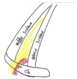
Scalenic fissure (schematic) - note the position of the brachial plexus (yellow)