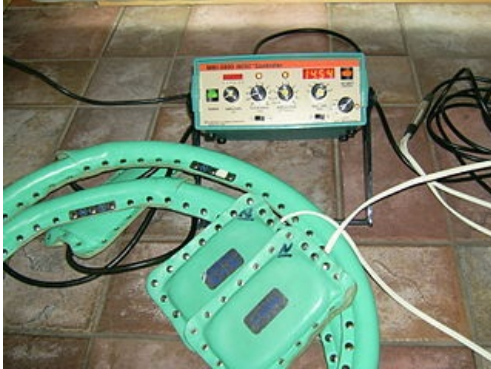
Drolet's 1990 Rhumart system, a PEMF device.

Pulsed electromagnetic field therapy (PEMFT), also called pulsed magnetic therapy, pulse magnetotherapy, or PEMF, is a reparative technique most commonly used in the field of orthopedics for the treatment of non-union fractures, failed fusions, congenital pseudarthrosis and depression. It relies on the usage of Pulses of the EMF, by using the magnetic field to pulse electric signals into the tissue and cell. This pulses simulate the kind of feedback a tissue would receive to start tissue healing. this technique is used by physicians to cure diseases and conditions such as chronic pain, depression, edemas and fractures.