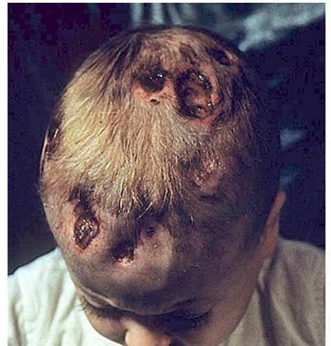
A child with a lytic defect of skull bones, Hand-Schüller-Christian disease