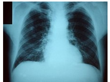
Pneumonia - chest scan

Inserting a simple [[File:Filename]] will display the image at its maximum size. If you want to shrink it, align it sideways or add a caption, use the so-called parameters. These are separated by a vertical bar (the "|" character below the edit box or key shortcut: right Alt + W).