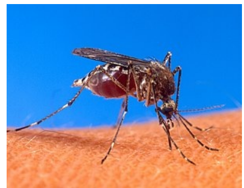
The vector of the dengue virus is a mosquito of the genus Aedes aegypti

Laboratory evidence is based on serological examination. There is no specific therapy or vaccine.