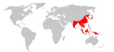
The incidence of Japanese encephalitis

Japanese encephalitis is a relatively rare disease found in most countries in East and Southeast Asia. Japanese encephalitis is transmitted by the bite of an infected Culex mosquito. The reservoir of infection is mainly birds, pigs and cattle. There is no human-to-human transmission. Individuals in agricultural areas of East and South-East Asia, especially children and the elderly, are at risk. Prevention is by the use of an inactivated vaccine.