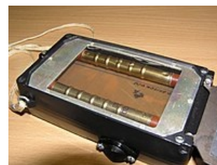
Ionization chambers in the dosimeter

Semiconductor detectors are based on ionization effects in solids . If an ionizing particle penetrates a suitable semiconductor, it creates an electron - hole pair by ionizing it, while most of the primary electrons have such a high energy that they cause further impact ionization of the environment. There is an avalanche-like release of electrons into the conduction band and the formation of holes in the valence band, so the number of released charge carriers depends on the energy of the primary particle. If we apply a voltage to this semiconductor, then due to the electric field, the free charge carriers (electrons and holes) will move in the appropriate direction and a current impulse will arise in the connected circuit, whose size depends on the energy of the incident particle of ionizing radiation. This makes it possible to use semiconductor detectors both for the detection of ionizing radiation and for spectrometric measurements.