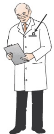
Location of personal dosimeter

The limit value of the effective dose of workers is given by legislation (Atomic Act) and is 100 mSv per 5 years and at the same time must not exceed 50 mSv per year. The limit value for e.g. the eye lens is 150 mSv per year, for limbs 500 mSv per year. Workers with sources of ionizing radiation (radiation workers) must be equipped with personal dosimeters or their dose is evaluated based on measurements at the workplace, so that it can be proven that they do not exceed the specified limits.