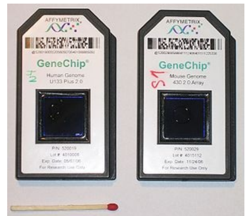
2 Affymetrix chips

We anchor the probes of the known sequence into the glass plate. Amplified fluorescently labeled DNA under investigation is hybridized to the chip, and the hybridization of this DNA to individual positions is detected by a reading device and a computer.