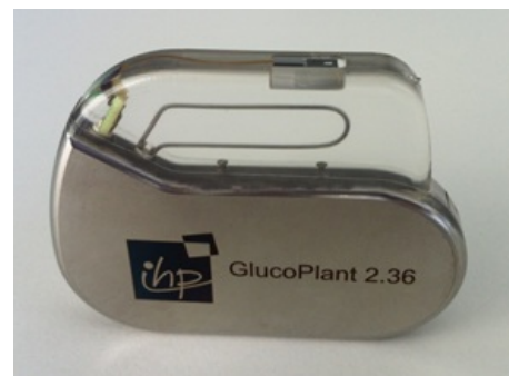
Sensor for continuous blood glucose measurement.