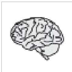
Neurochirurgie.png 50 × 50; 5 KB

The following 2 files are in this category, out of 2 total.