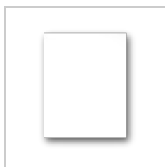
Medical Informati... ; 130 KB