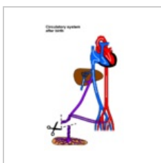
Circulation neona... 500 × 800; 40 KB