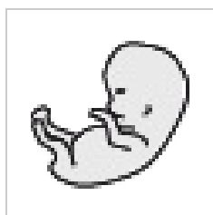
Embryologie.png 50 × 50; 5 KB