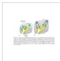
WNT .png 982 × 614; 161 KB