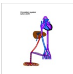
Circulation fetal... 500 × 800; 40 KB

The following 5 files are in this category, out of 5 total.