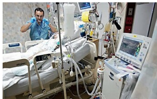
Patient on UPV in intensive care unit