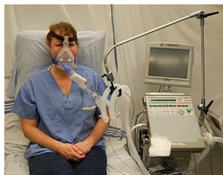
Non-invasive positive pressure pulmonary ventilation ( NPPV, NIV )