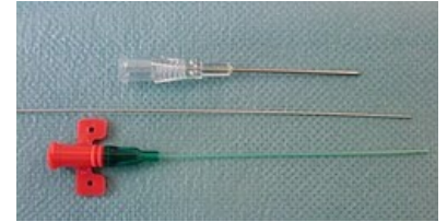
Arterial Catheter for the Seldinger technique