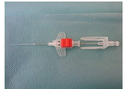
Arterial catheter for „over the needle“ technique

An aseptic technique involves disinfection, a sterile dressing, face masks, sterile gloves. It is important to administer a sufficient dose of local anaesthetic (Lidocaine 1%, Mepivacaine), checking the correct puncture location (in pulse waveform, blood flows out of the catheter) and a careful documentation (date and time of catheter insertion, puncture site, application of local anaesthetic).