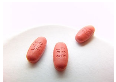
Stalevo® (combination: levodopa, carbidopa, entacapone)